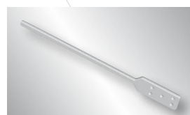
KUH.15.500/15X70X500mm KUH.15.800/15X70X800mm KUH.1000/25X120X1000mm KUH.1200/25X120X1200mm