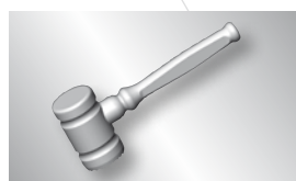
KLA.60/D60X260mm KLA.80/D80X271mm KLA.100/D100X284mm