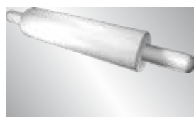
VAL.70.300/D70X300mm VAL.70.400/D70X400mm VAL.90.300/D90X300mm VAL.90.400/D90X400mm VAL.90.500/D90X500mm